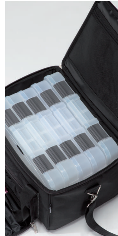
BB2.N with 5 boxes