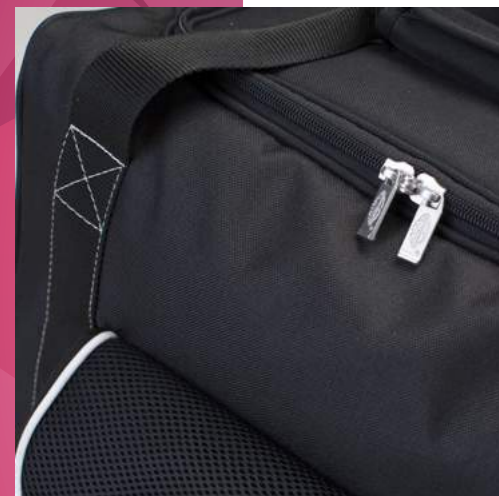
PADDED TECHNICAL FABRIC

It is possible to choose to customize the outside of the bags by Cantoni with a specific logo or name. Hand made in Italy