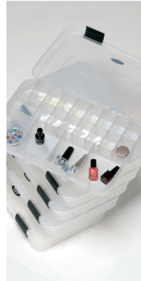
THE BOXES Clip locks and movable partitions (from 3 to 21 compartments)