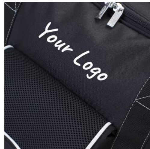
EXAMPLE OF PRINTED LOGO