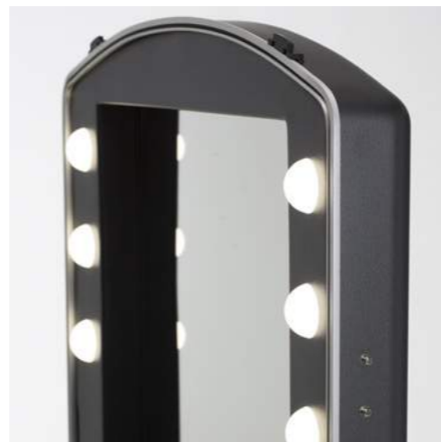
CANTONI I-LIGHT LIGHTING SYSTEM with dimmer button to adjust the brightness

Lighter and thinner with respect to the eldest sister VOYAGER, the lit-up make-up station of the Voyager SLIM is the perfect synthesis between style, space and ease of transport.