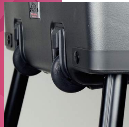
RUBBER WHEELS with bearings