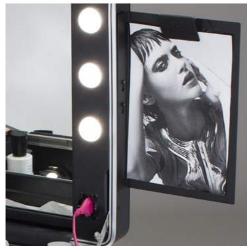
Standard equipment to fasten the stand supporting projects. Universal power socket 110-240V