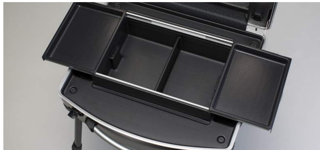
Sliding drawers with magnetic closure, aluminium guides and large compartment.