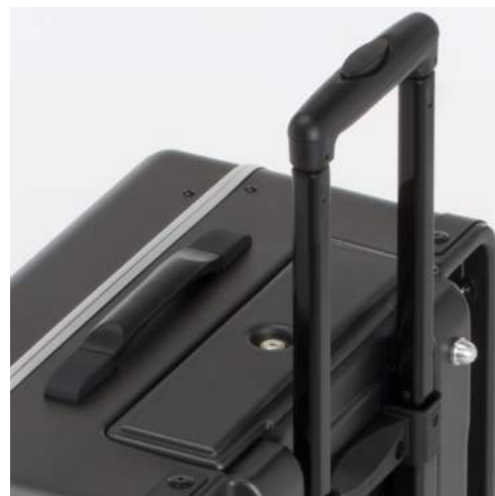
TELESCOPIC TROLLEY with spring lock button