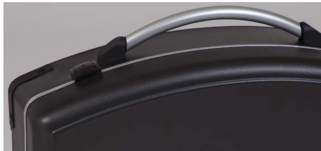
DESIGN WITH ROUNDED LINES BIG HANDLE IN ANODISED ALUMINIUM WITH KEY LOCKS