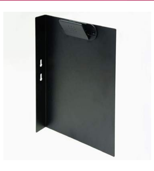
HOLDING PROJECTS STAND Comfortable and stable support for make-up projects, it fits into the hooks on the side of the case. Made of lightweight and durable aluminium.