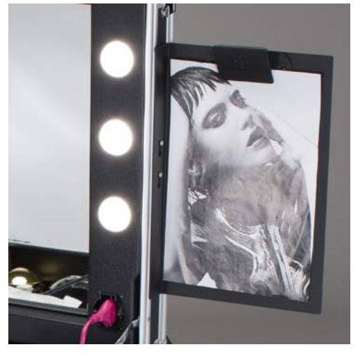
Standard equipment to fasten the stand supporting projects. Universal power socket 110-240V