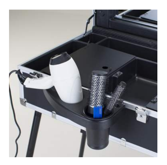
HOOKING HAIRDRYER HOLDER It can be hooked to any side of the case. In ABS, it does not deform with the heat of the hair-dryer