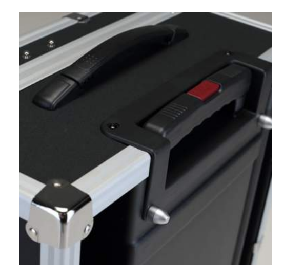
Trolley with square section telescopic handle. Retractable handle with locking button.