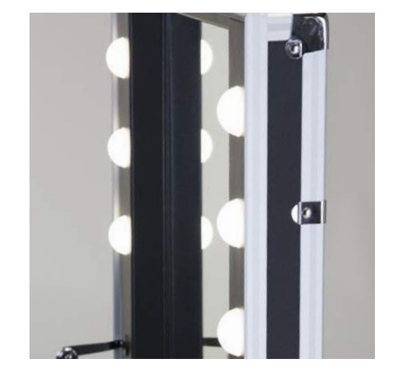
CANTONI I-LIGHT LIGHTING SYSTEM with dimmer button to adjust the brightness

Easy to carry, the VT101C make-up case with lights, large and solid, is the most classic and sold by Cantoni. Perfect both in beauty salon and in motion