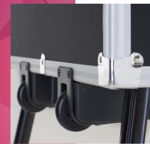
RUBBER WHEELS with ball bearings

Quick and easy opening and closing system, thanks to the built-in telescopic legs. Details with engraved Cantoni logo.