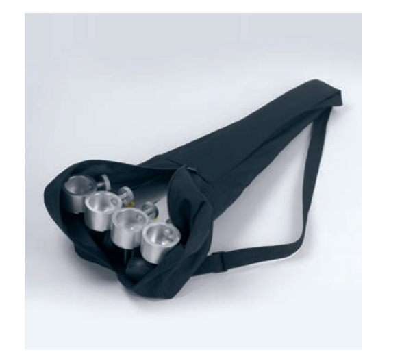
X4 +SX4 WHEEL SYSTEM FOR MAKE-UP CASE System of strong wheels with lock to apply to the legs of the make-up case. Folding, it can be stored in the suitable carrying bag. In aluminium.