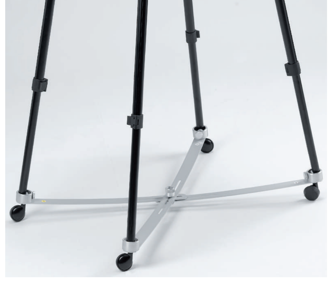
X4 +SX4: HOW TO USE IT The Rolling System is a useful accessory that allows to easily move the make-up case once opened.