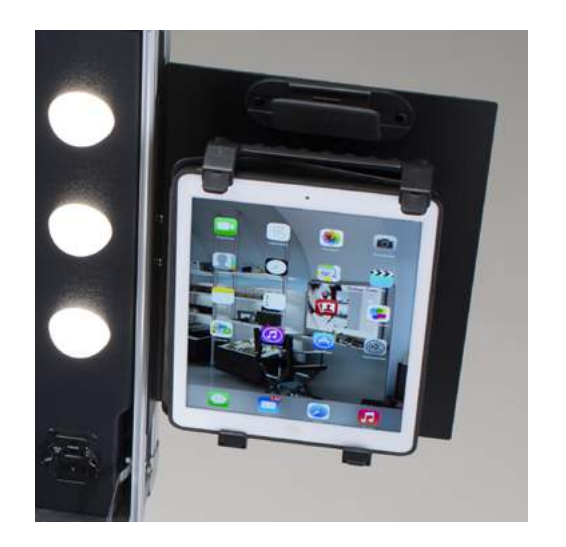
DIGITAL SUPPORT FOR STAND This locking system allows to securely fit on the projects stand both digital frames and tablets.