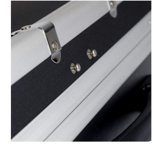
EQUIPMENT with standard locking system to holding projects STAND