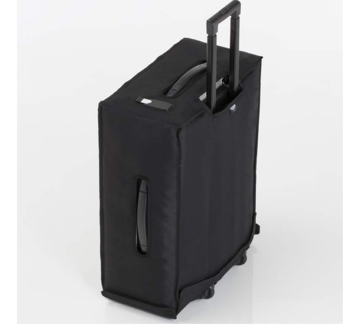
COVER: TO PROTECT THE CASE

The protective cover for the VT and VP make-up cases are made of padded and waterproof technical fabric.