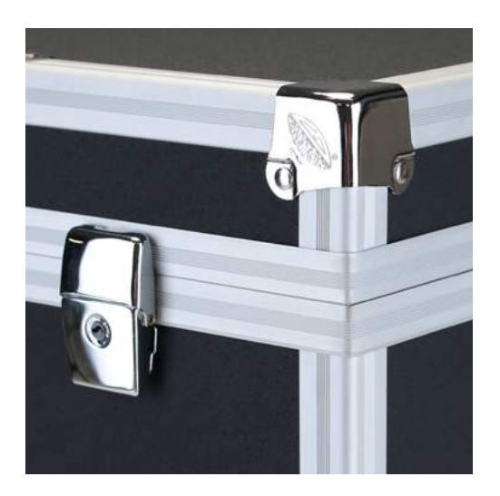
ANODISED ALUMINIUM PROFILES CHROME ACCESSORIES KEY LOCK