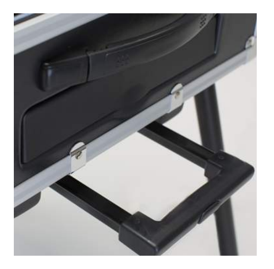
TELESCOPIC TROLLEY with spring lock button REINFORCED STRAP HANDLES