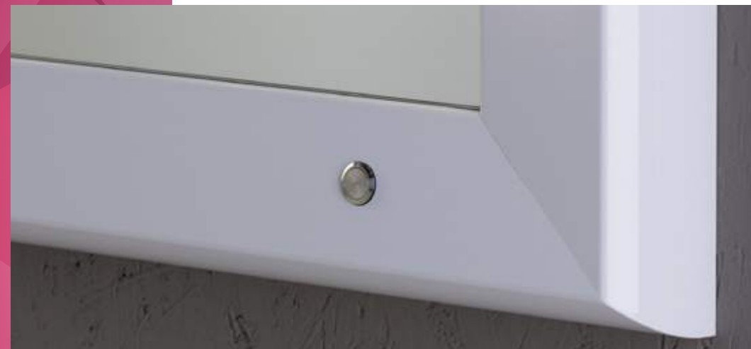
The ideal light reception on the face is guaranteed by the 5° splaying of the frame. Detail of the frontal, metal chromed light actuator.