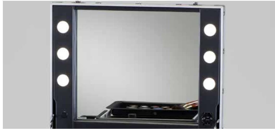
Professional lighting: 6 I-light lighting points, adjustable intensity option