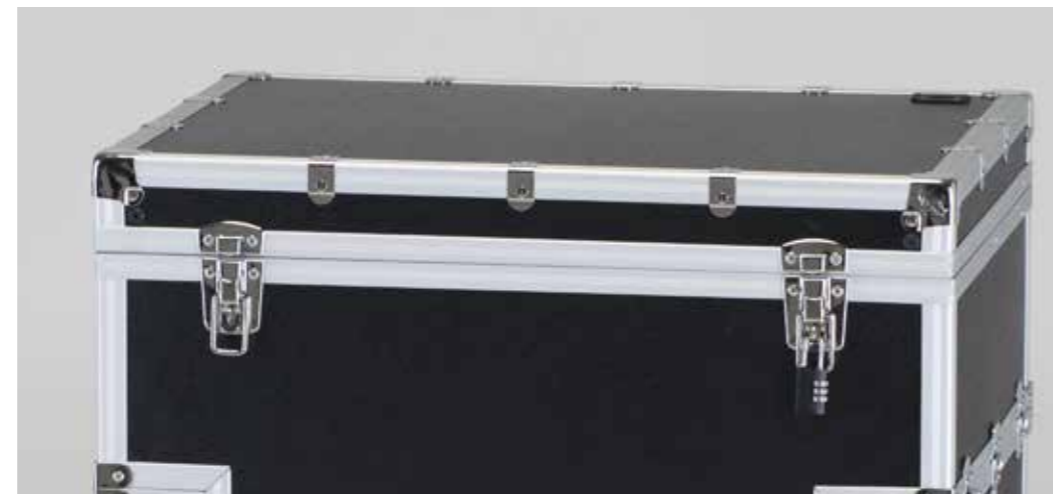
LATCH BLOCKS WITH RING FOR INSERTION OF PADLOCKS. 10 latch blocks with ring for insertion of padlocks on all the display mobile elements.