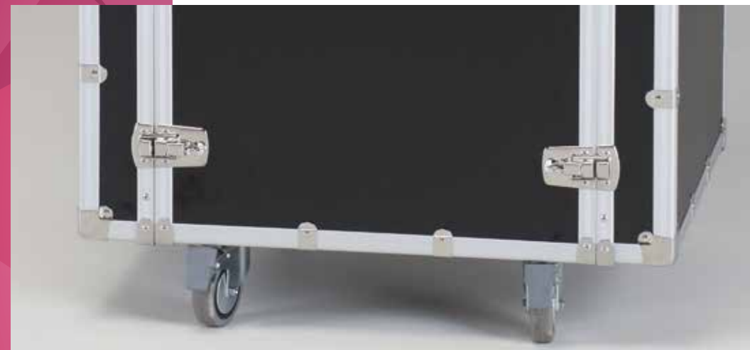
WHEELS WITH STOP 4 sturdy pivoting wheels with blocking stop.