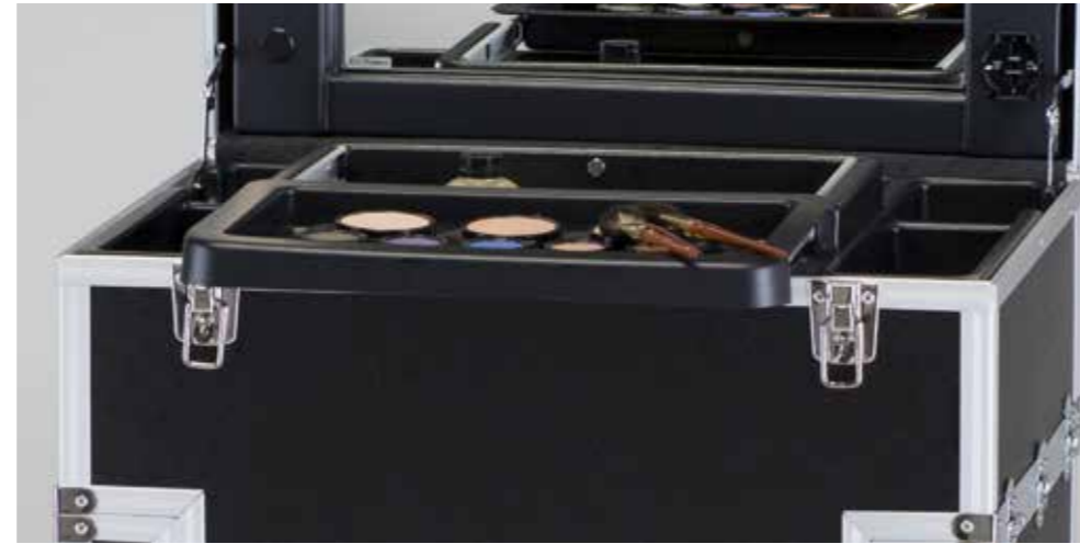
Upper block with 4 slots, deep central space and sliding tray

The MAKEUP STAND with mirror can be set effortlessly turning into a double promotional beauty workstation: the tables offer a large space for products, while the upper block is a gorgeous makeup station with a wide lighted makeup mirror.