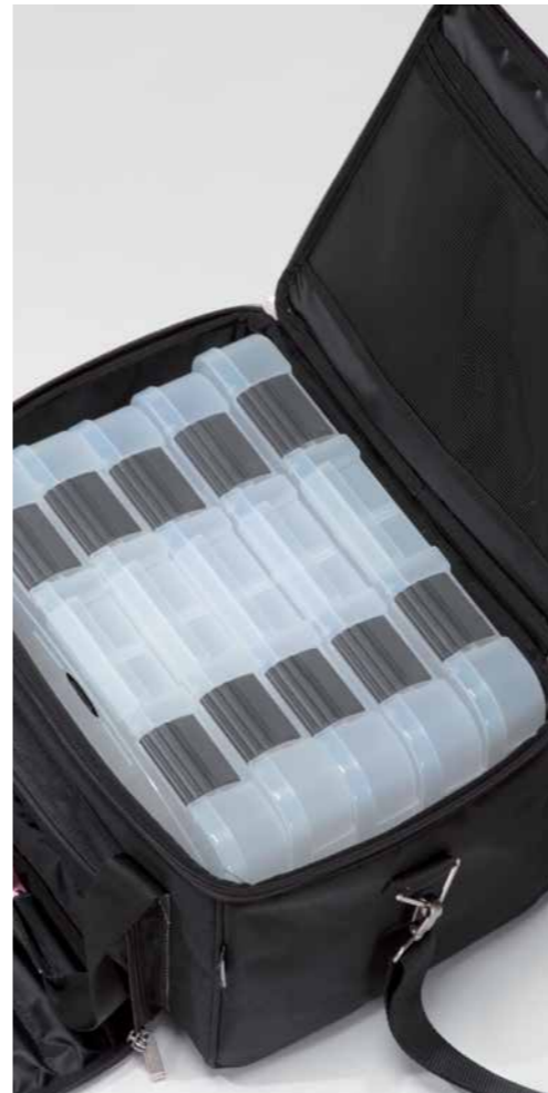
BB2.N with 5 boxes