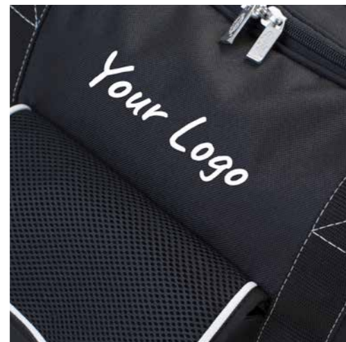
EXAMPLE OF PRINTED LOGO