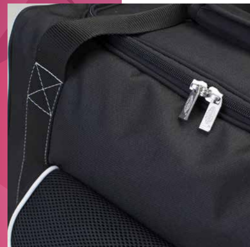
PADDED TECHNICAL FABRIC