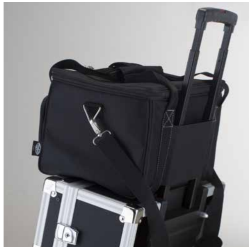
Rear flap to insert on trolley handle all Cantoni make-up stations