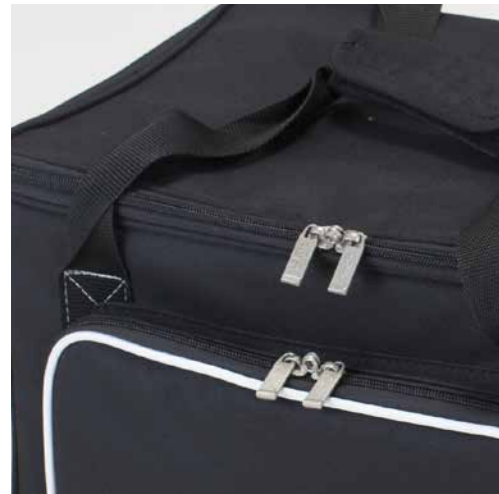
Padded technical fabric, zipper closures Adjustable shoulder strap, reinforced handles