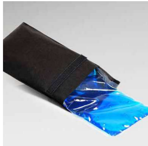
Supplied with hot/cold GEL case for preserving products