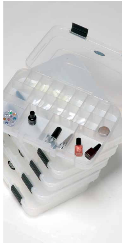
THE BOXES Clip locks and movable partitions (from 3 to 21 compartments)