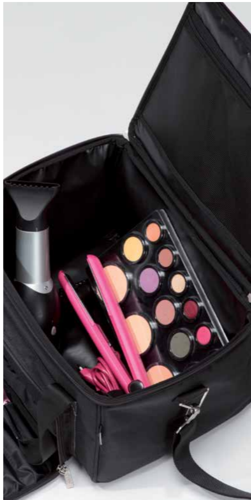
BB2.T Large interior space