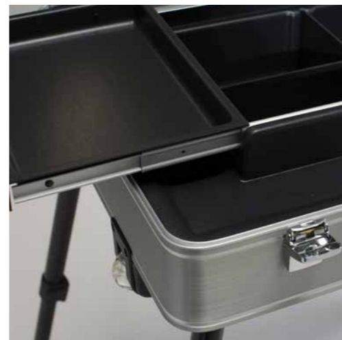
SLIDING TRAYS KEY LOCKS