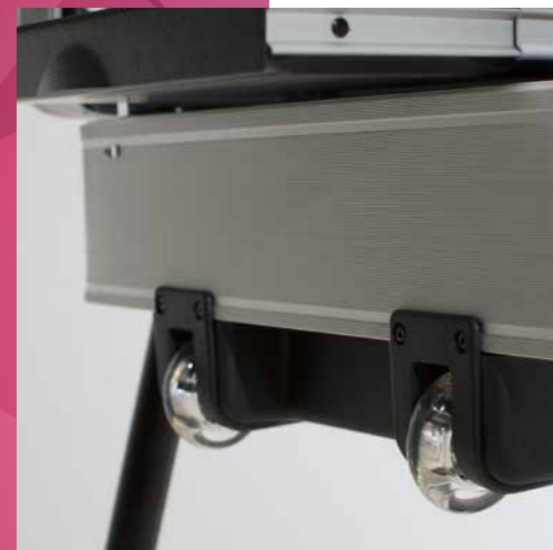
TRANSPARENT RUBBER WHEELS with ball bearings