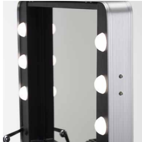
ANODIZED ALUMINIUM PROFILE ABS STRUCTURE Convex design Cover