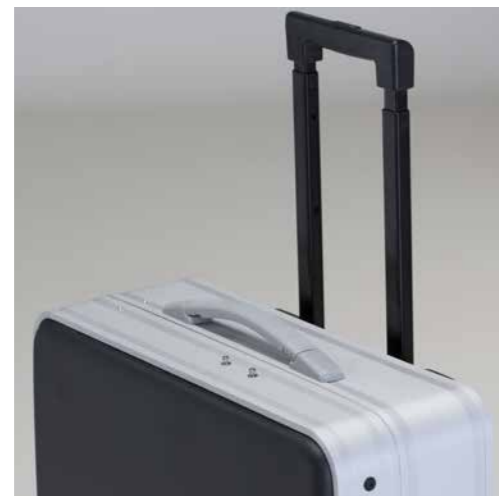
TELESCOPIC TROLLEY with spring lock button REINFORCED STRAP HANDLES