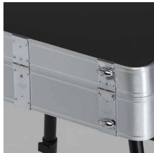
REINFORCED CHROME HINGES