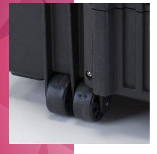
4 SILENT AND STURDY SELF-LUBRICATING WHEELS

Several trays and large drawers and well divided allow safe transportation and organization of all material.