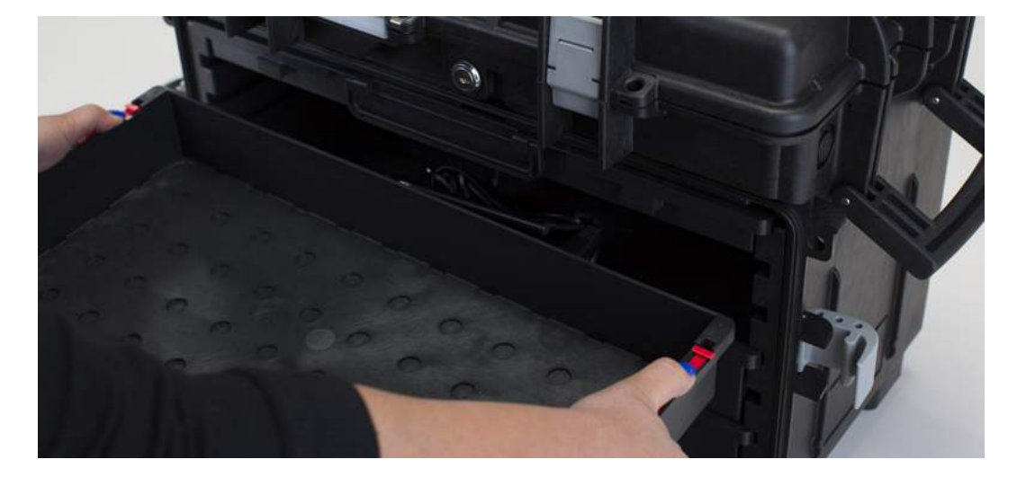
Lock button to prevent accidental exit of the drawer with the possibility to remove it completely