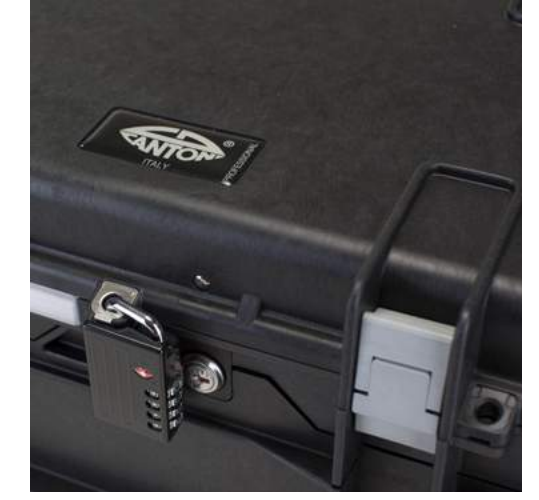
TSA approved padlock with combination: it allows to close securely. The case, but allows the authorized security personnel the fast content inspection

1 drawer 30 mm high - 2 drawers 60 mm high - 1 drawer 90 mm high