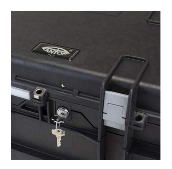
Central locking with key provided as standard: close simultaneously both covers, lids, the top and the front one

Divided in a rational and flexible way to store products in a personalized