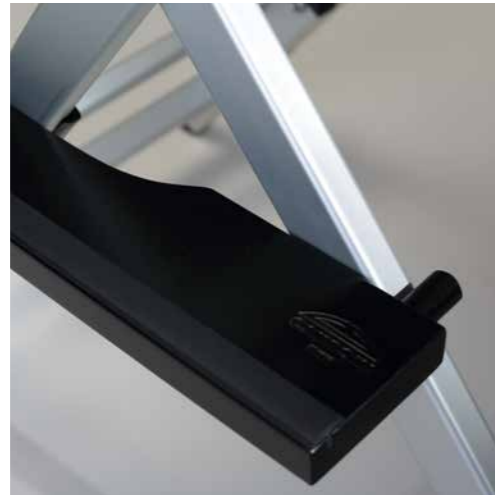
Black lacquered FOOTREST with anti-slip band and engraved Cantoni's logo