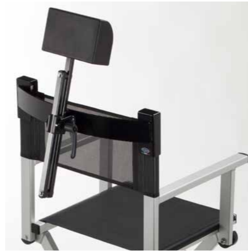
DETACHABLE HEADREST on request

Portable chair for professional make-up, produced in Italy. Characterized by very low weight which makes it easy to transport.