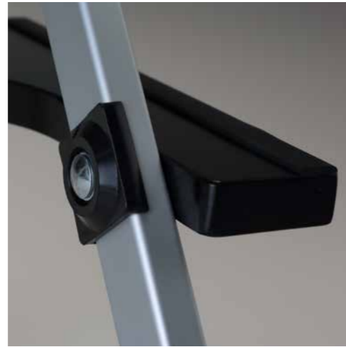
FOOTREST rear reinforcement