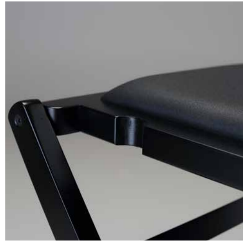
Black lacquered beech structure