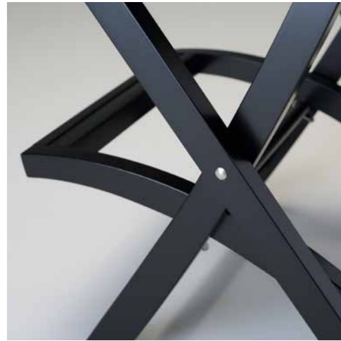
Non-slip and anti-tilting footrest