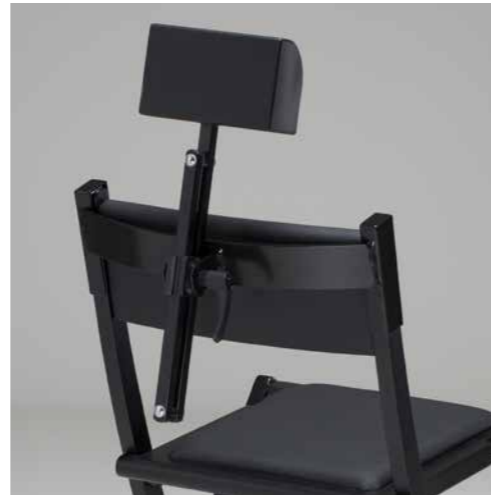
DETACHABLE HEADREST on demand

Innovative make-up chair created by Cantoni: characterized by the absence of the armrests, for ease of movement and make-up operations, it is hand-crafted in Italy. The original and elegant line makes it perfect as a piece of furniture.