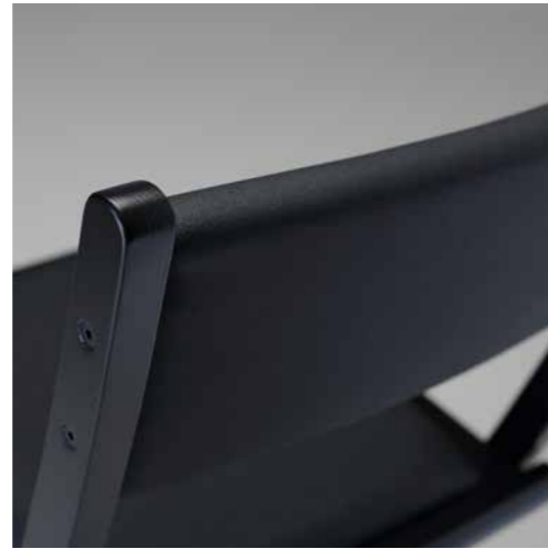
Seat and backrest padded and covered with black faux leather