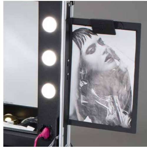
HOLDING FACE-CHART STAND Universal power socket 110-240V