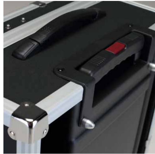
Trolley with square section telescopic handle. Retractable handle with locking button.