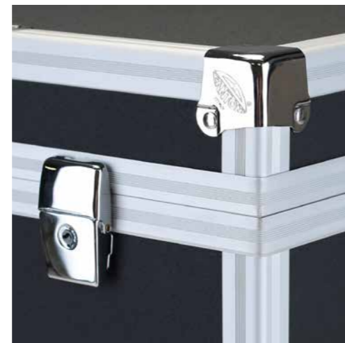
ANODISED ALUMINIUM PROFILES CHROME ACCESSORIES KEY LOCK