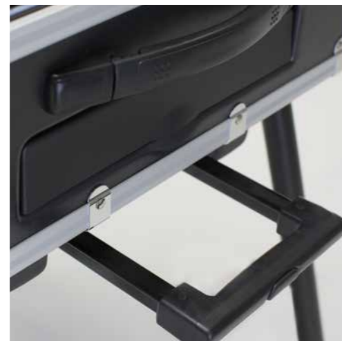
TELESCOPIC TROLLEY with spring lock button REINFORCED STRAP HANDLES