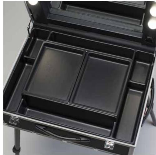
Large central compartment, sliding trays with aluminium guides, magnetic closure