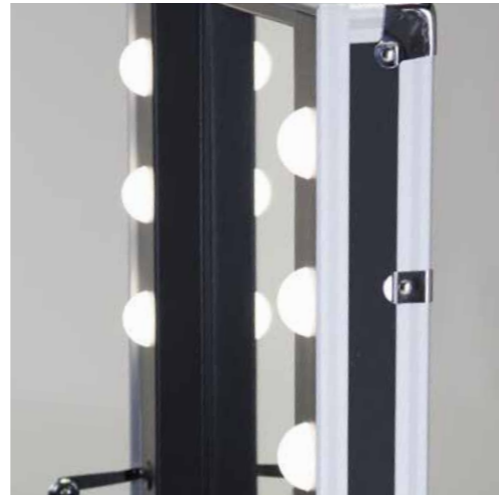
CANTONI I-LIGHT LIGHTING SYSTEM with dimmer button to adjust the brightness

The VT101C-TR station is the make-up case that combines ideal capacity, comfortable work spaces and transportability.