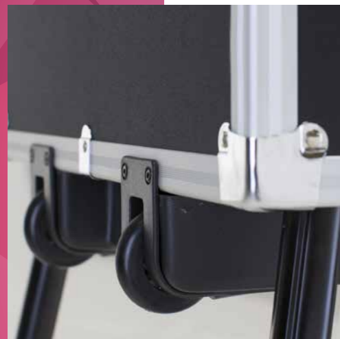
RUBBER WHEELS with ball bearings