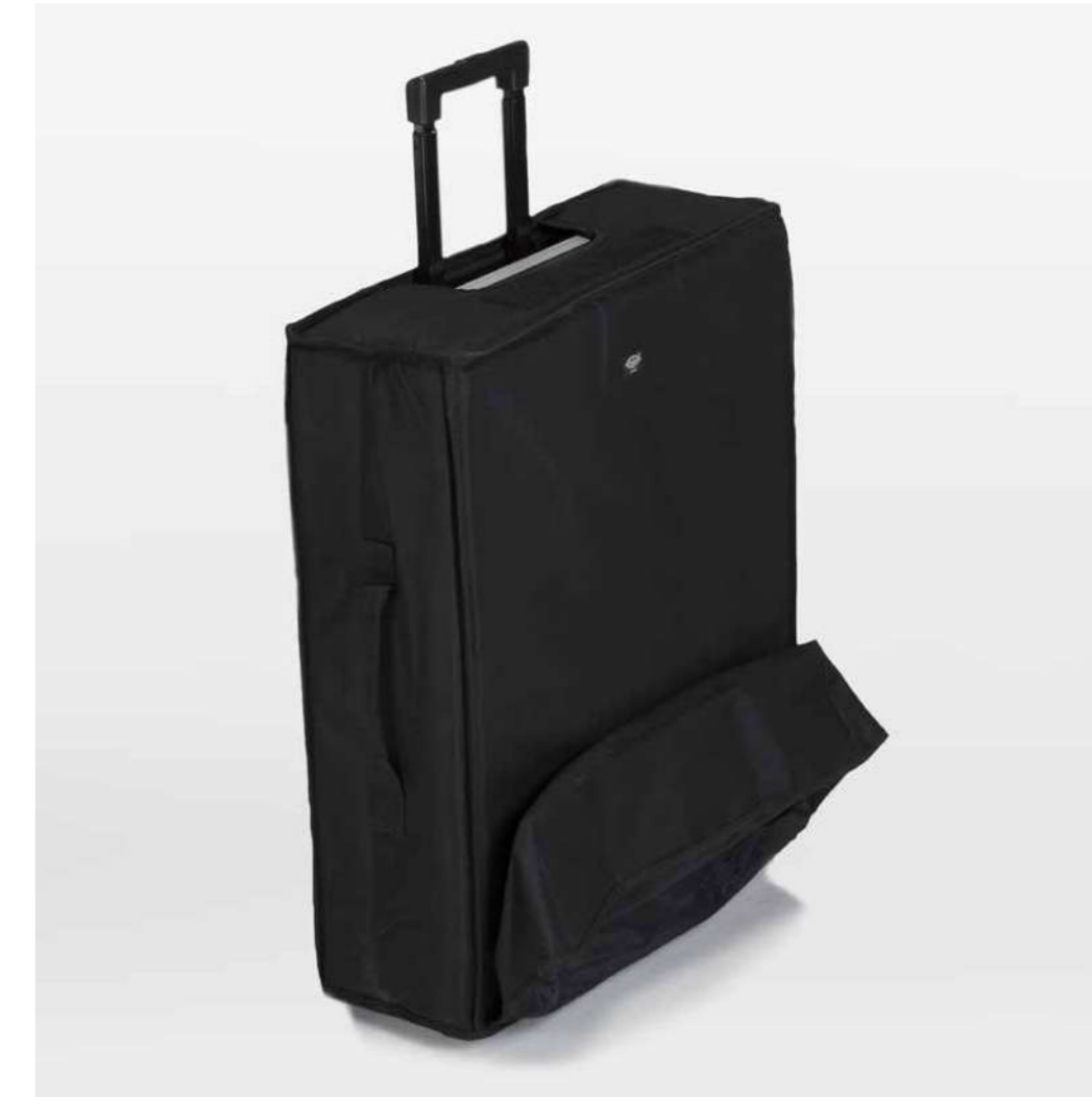
COVER: TO PROTECT THE CASE The protective cover for the VT.NAILS is made of padded and waterproof technical fabric. The handles and wheels are not covered and the surface is protected against scratches and bumps.