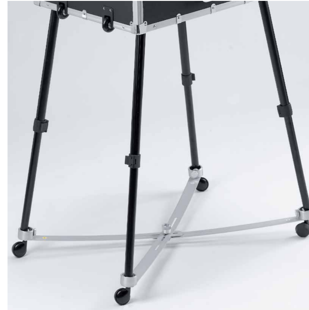
X4 +SX4: HOW TO USE IT The Rolling System is a useful accessory that allows to easily move the make-up case once opened.