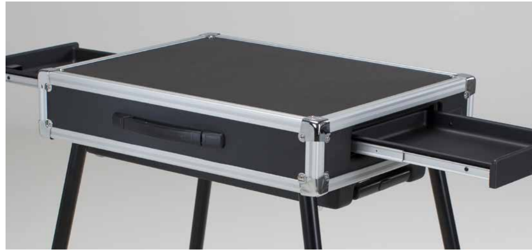
Two sliding drawers to extend the support surface for materials without cluttering the workspace