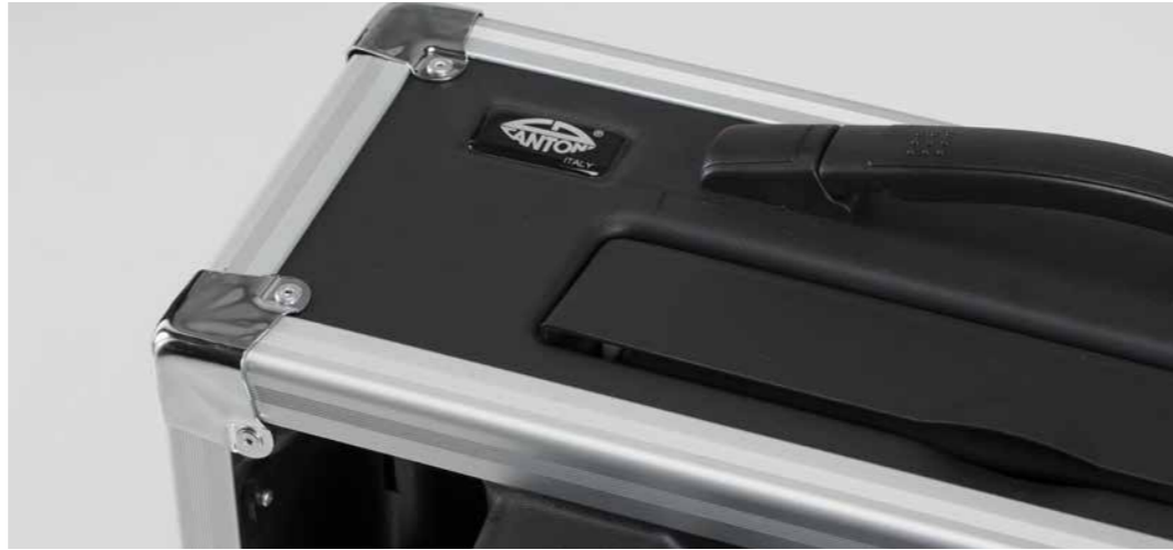
Built-in trolley with square section telescopic handle. Handle with lock button.