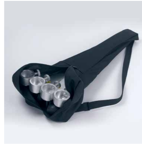
X4 +SX4 WHEEL SYSTEM FOR MAKE-UP CASE System of strong wheels with lock to apply to the legs of the make-up case. Folding, it can be stored in the suitable carrying bag.