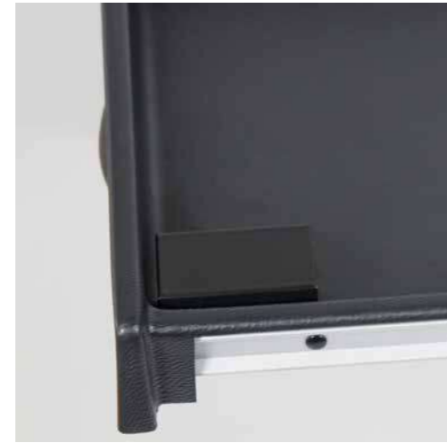
Universal hooking system for nail reconstruction lamps