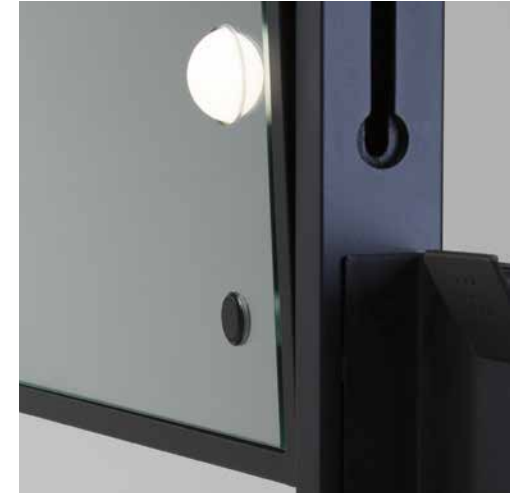
Dimmer button for adjusting light brightness

The L400 Full Mirror wheeled make-up station is equipped with 4 large side drawers, 6 I-light lamps embedded in the mirror. It is an excellent solution for furnishing make-up corners in shops and stores. The version with double mirror (front and back) is ideal for make-up academies.