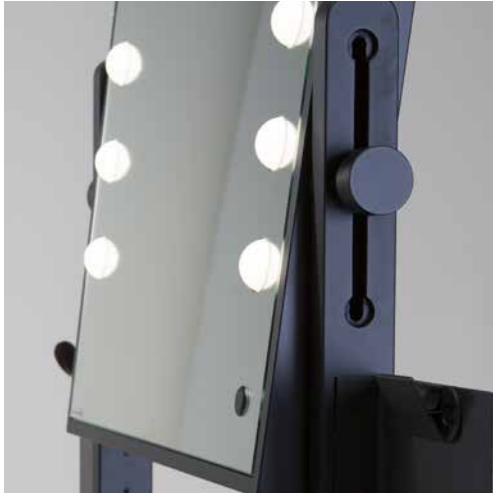
KNOB to lock mirror tilting angle and height