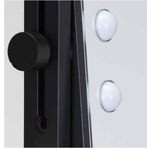
Large mirror with lights embedded I-light