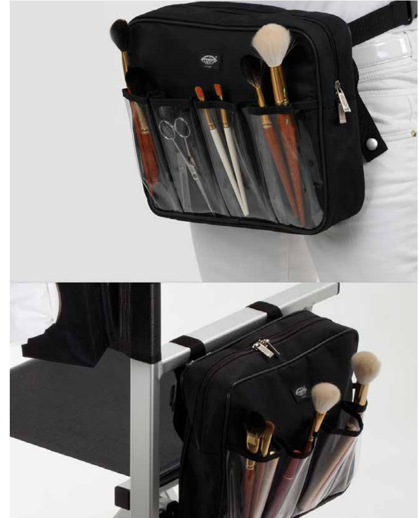
B03 Bag with brush holding pocket It can be worn to the belt or applied to the arm of the chair.