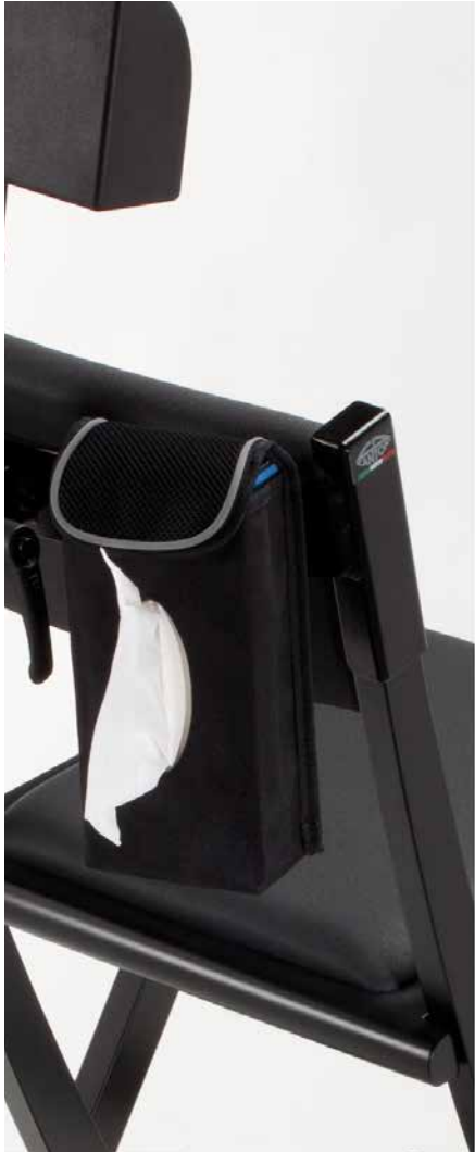
KH Towel holder in washable technical fabric. It can be hooked to the arm of the chair, to the HR headrest or to the belt.